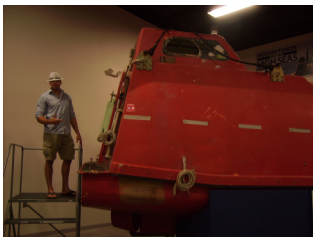
Gold Coast members